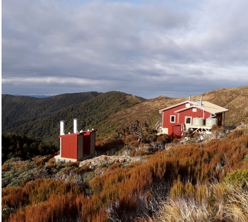
The new Moonlight Tops hut

Read the full report on our website, www.greycdc.govt.nz/surveys .