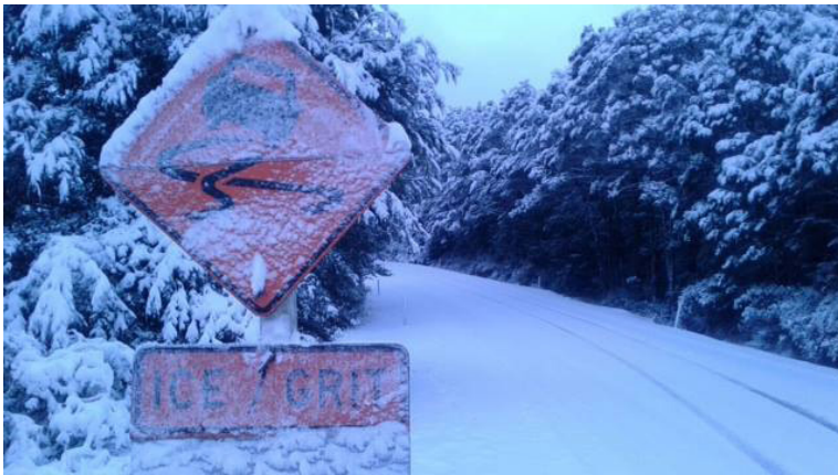
Photo of Lewis Pass, July 2017