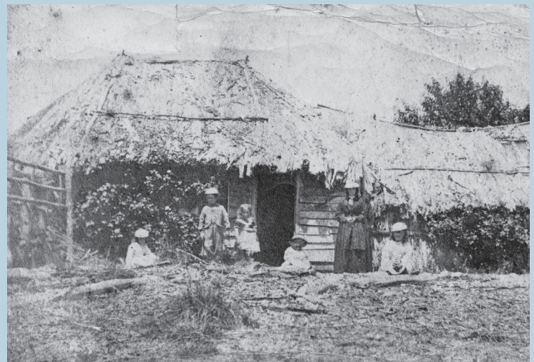
Mackley homestead, Waipuna, 1870's