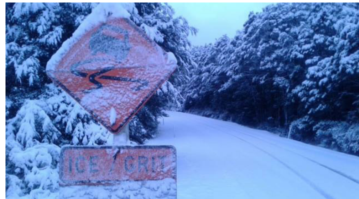
Photo of Lewis Pass, July 2017