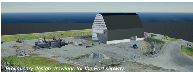
Preliminary design drawings for the Port slipway.