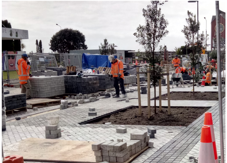
Progress on Tainui Shared Street as at 12 October 2017

The new spaces will be officially opened on Saturday 9 December as part of the Christmas parade - refer to the back page for more information on the Christmas Carnival and the many exciting activities planned.