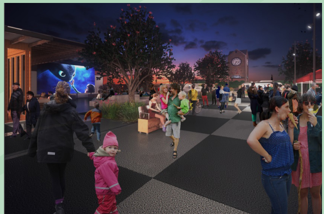
Artist impression - night market in Tainui Shared Street